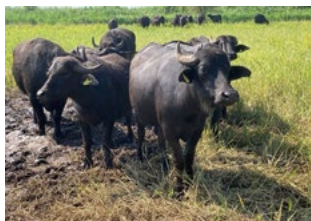
Water Buffaloes