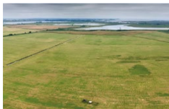
Polder Bargischow Süd