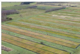
Aerial view of the 20 ha Sphagnum paludiculture site in the peatland Hankhauser Moor near Oldenburg/ Lower Saxony