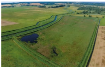
10 ha Typha paludiculture in June 2024