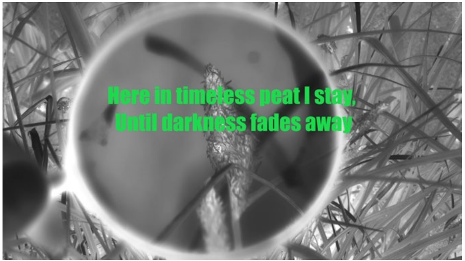
Video stills from In Zombie Fire (Jeanna Kolesova)